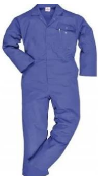
Overall for Architectural Technology Level 6, Construction Management Level 6 & Quantity Surveying Level 6 – Light Blue