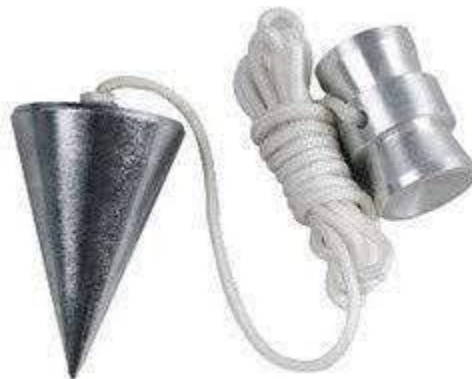
6.PLUMB BOB SIZE NO 6