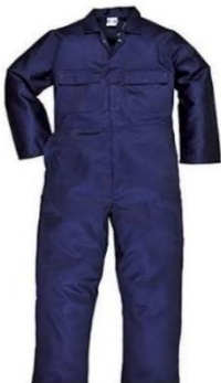
Overall for Civil Engineering Level 6 – Navy blue