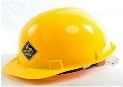
Safety Helmet yellow in color