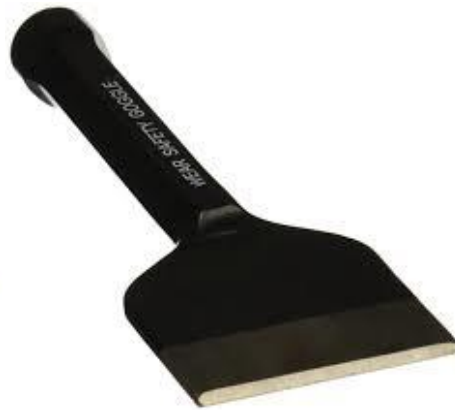
4.FLAT COLD CHISEL