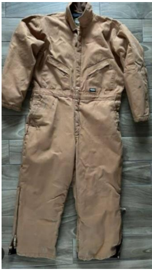
Overall for Building Technology Level 6 – Brown