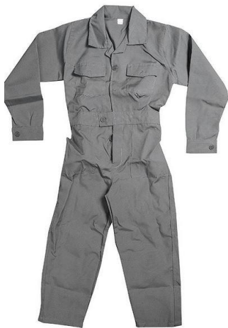
Overall for Plumbing levels 4 & 5 – Grey