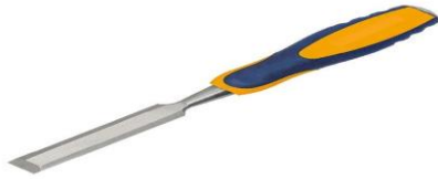
Chisel 1/2 inch