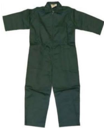
Overall for Masonry level 5 – Jungle green