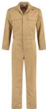
Overall for Building Technician level 5 – Beige