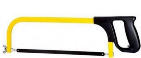
Hacksaw with blade