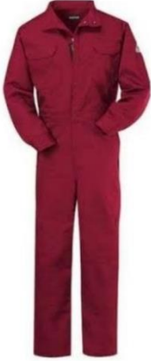
Overall for Carpentry levels 4&5 – Maroon